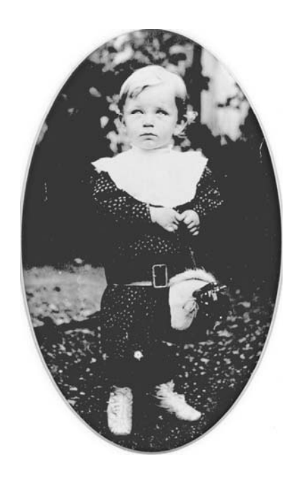
Fig. 3 George Gamow (3 years old) at the village near Odessa

My father's father was commander of the Kishinev garrison, a general or something in the Russian Imperial Army and my mother's father was Archbishop of Odessa and in charge of all the religion for all the lands north of the Black and Azov Seas called New Russia [Novorossia].