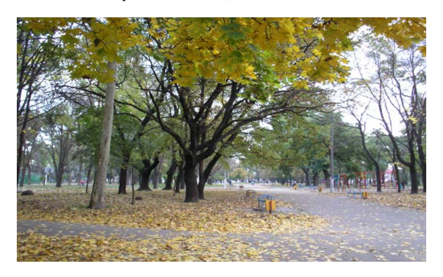
Fig. 6 Gamow's square in Odessa

The First Odessa Gamow's Conference: "Astrophysics and Cosmology after Gamow" (September 5-10, 1994) was held with financial and organizational support of Euro-Asian Astronomical Society. After the appeal of participants of the First Gamow conference and rector of Odessa University to Odessa Mayor, a decision was made to name one of the beautiful Squares in Odessa, after Gamow.